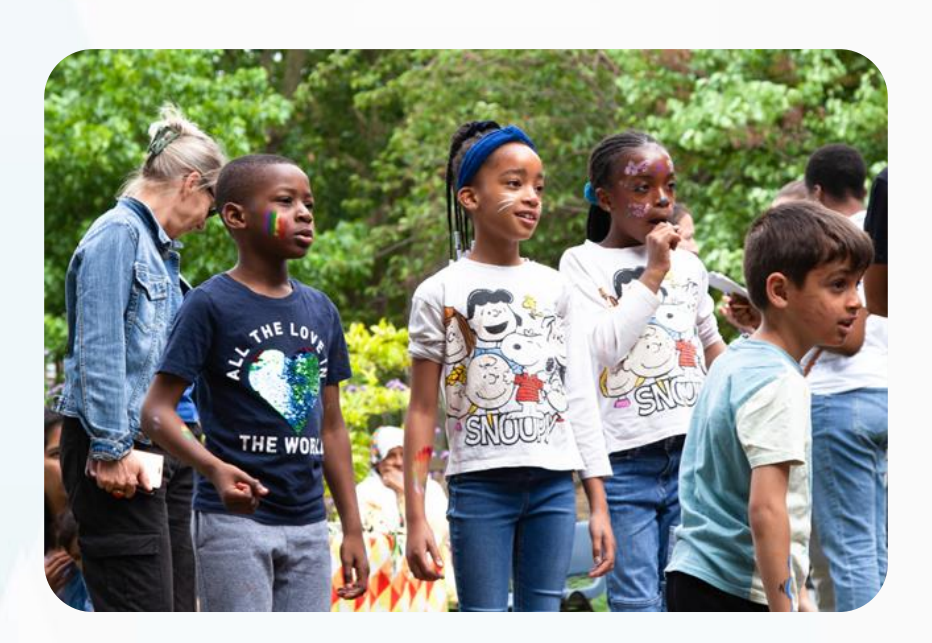
A family event