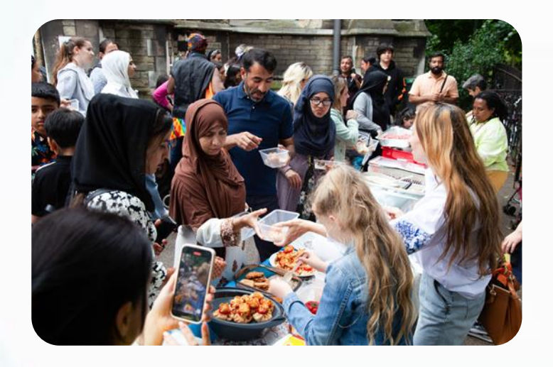
Traditional food was prepared by the Syrian, Ukrainian and Ethiopian communities

A plethora of organisations in Southwark joined us on the day to provide services to members of the Refugee community: