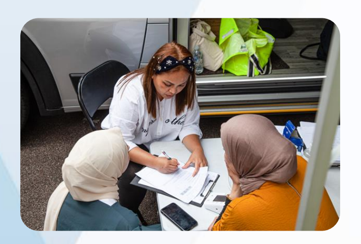
Advice & Information

We were grateful for the presence of Southwark Refugee & Migrant Project.