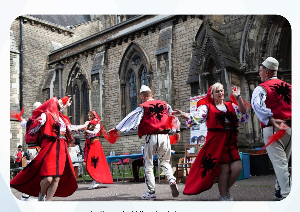
Ardhmeria (Albanian) dance group