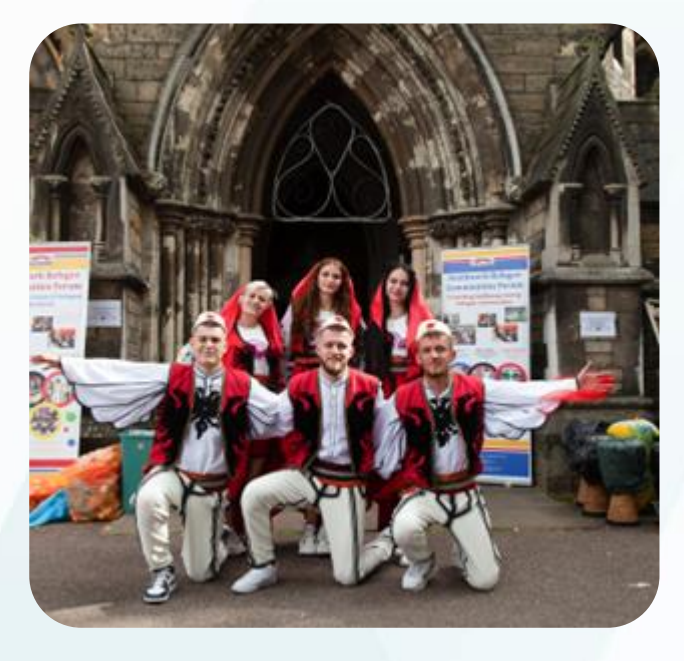
Ardhmeria (Albanian) group